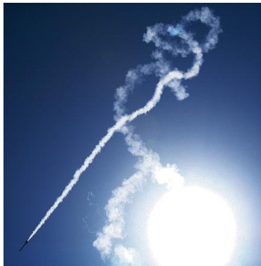
Flight of an unstable rocket